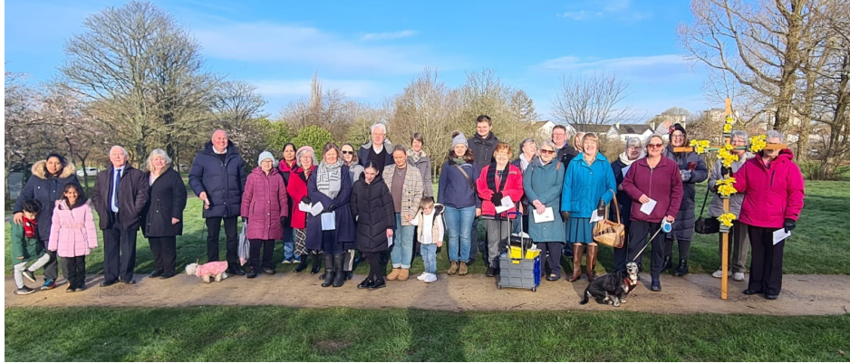
Easter worship in Knightswood park